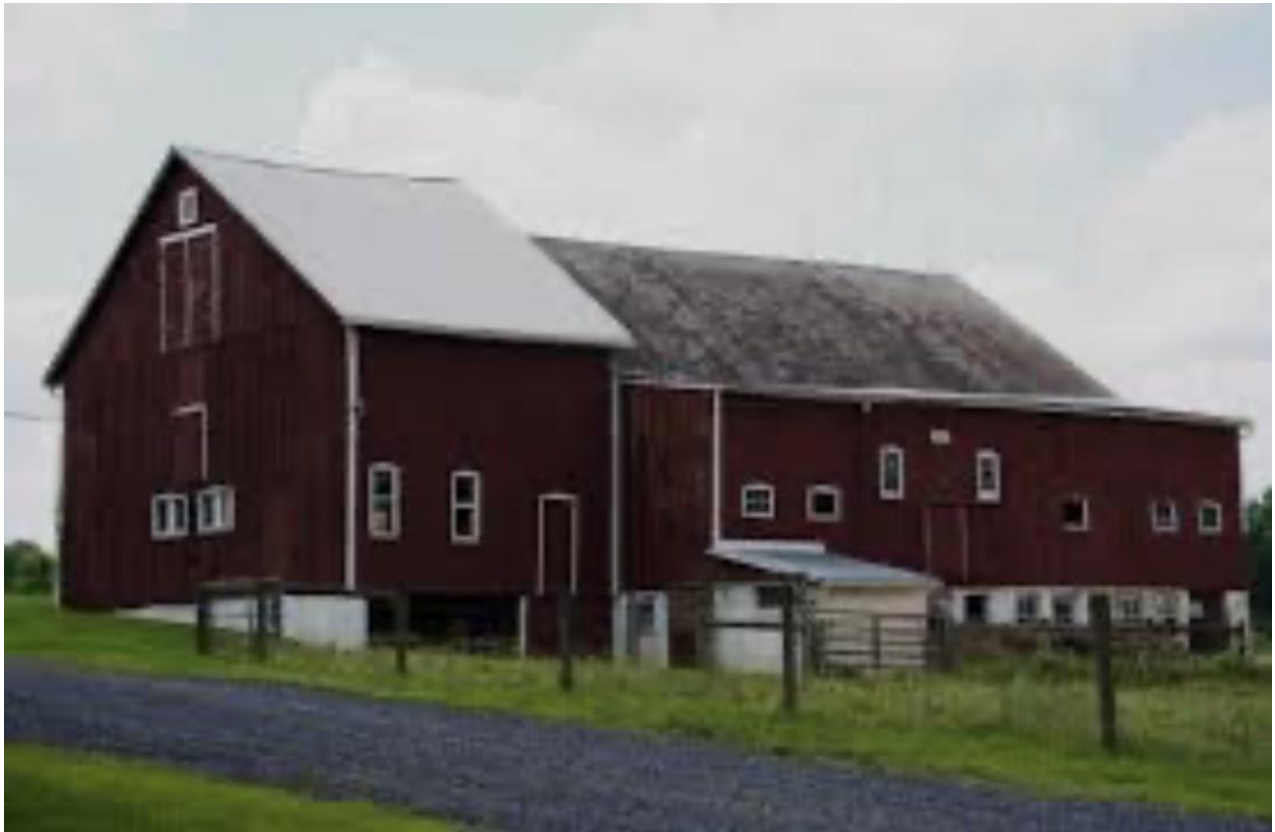
Barn in Bucks County, Pennsylvania